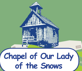
Chapel of Our Lady of the Snows